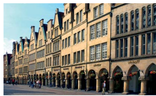
Münster, Prinzipalmarkt

Potential non-academic fields of employment include the media, publishing, advertising, public relations, museums, festival organisation, consulting, national and international organisations dealing with migration, language policy, or international cultural relations, as well as multinational businesses in various sectors.