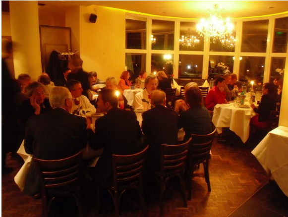
Reception at the Schlossgarten Restaurant